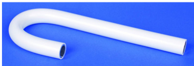
6006 Post Return