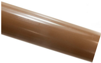
6013 90° Inside Corner Bracket Kit