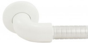
6017 Wall Return with Joiner and Cover Plate