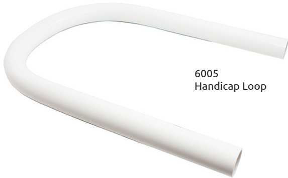
6005 Handicap Loop

Each part is finished in a tough powder coating that ensures minimum maintenance and lasting color.