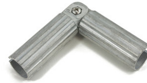
6008 Adjustable Joiner