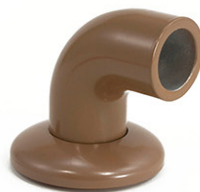
6001 Wall Return with Cover Plate Kit