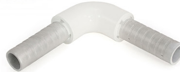
6016 90° Corner with Joiners